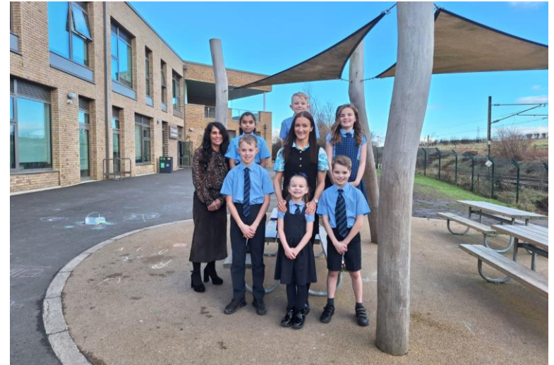
St Thomas' received glowing inspection report.