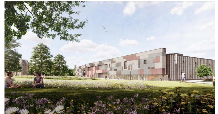
Main construction phase due to start later this year.