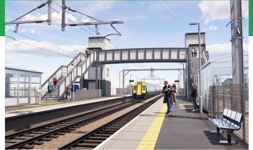
Work will start soon on new Balgray Station.