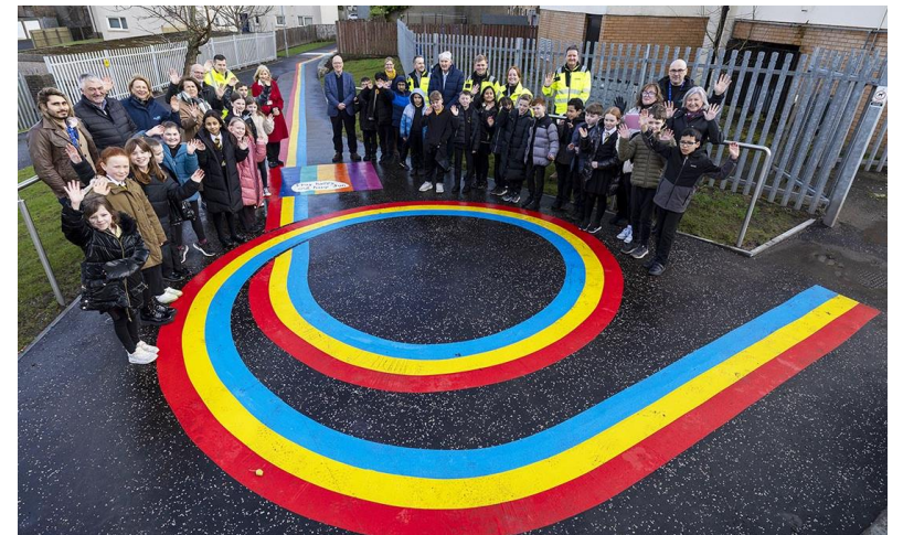
Thornliebank Lanes project.