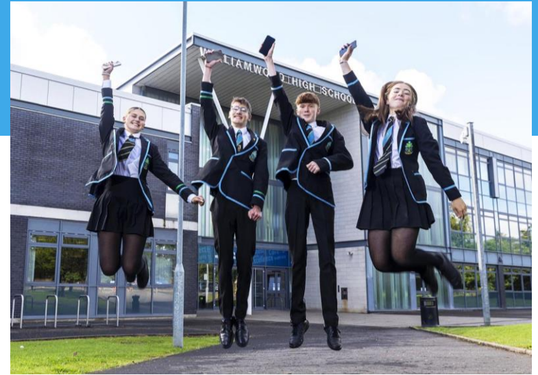
Williamwood pupils celebrate exam success.