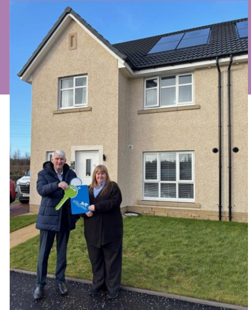
Residents get keys to new homes in Maidenhill.