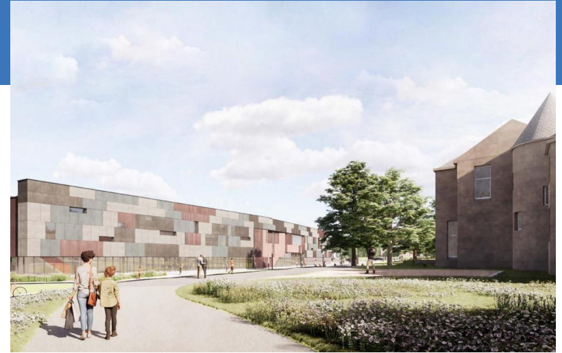
New Eastwood Leisure Centre and Theatre.