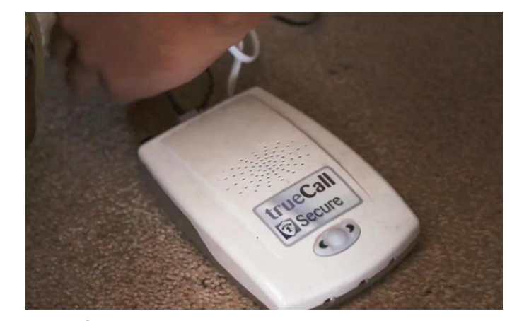
Blocking calls stops scams.