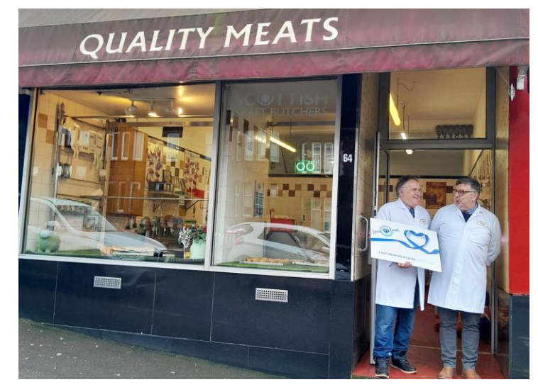
Gift cards also boosted local businesses.