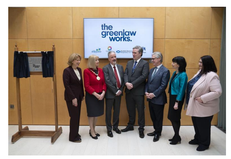
The Greenlaw Works official opening.