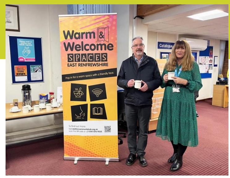
One of our first Warm and Welcome Spaces.